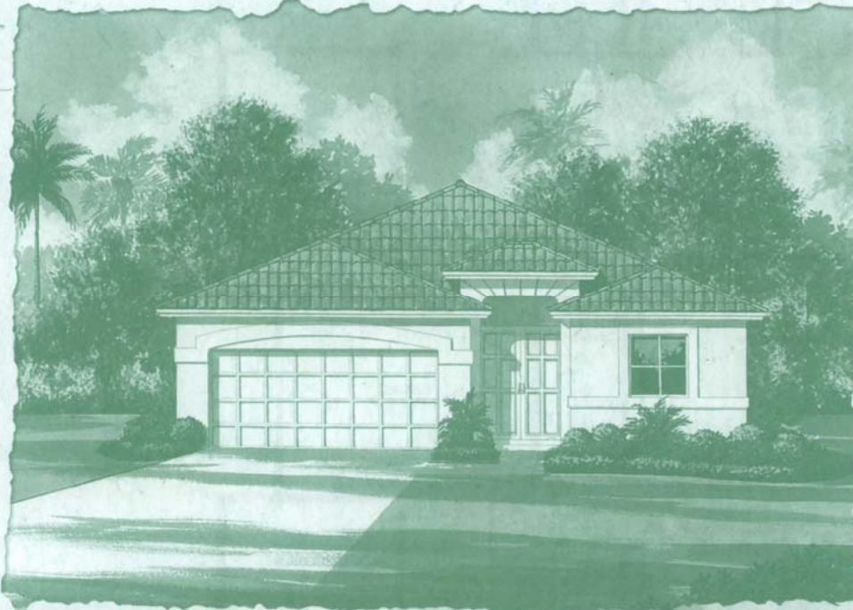
SAPPHIRE MODEL - ELEVATION 1