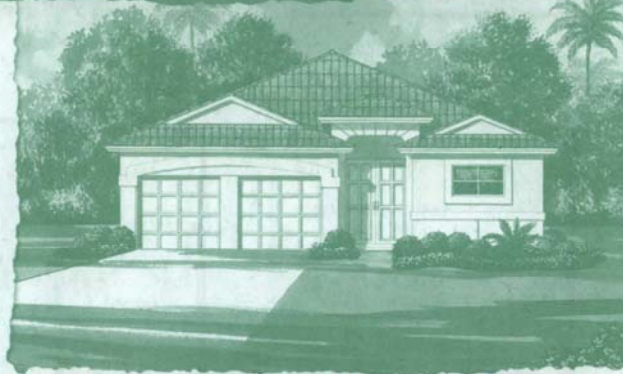
SAPPHIRE MODEL - ELEVATION 2